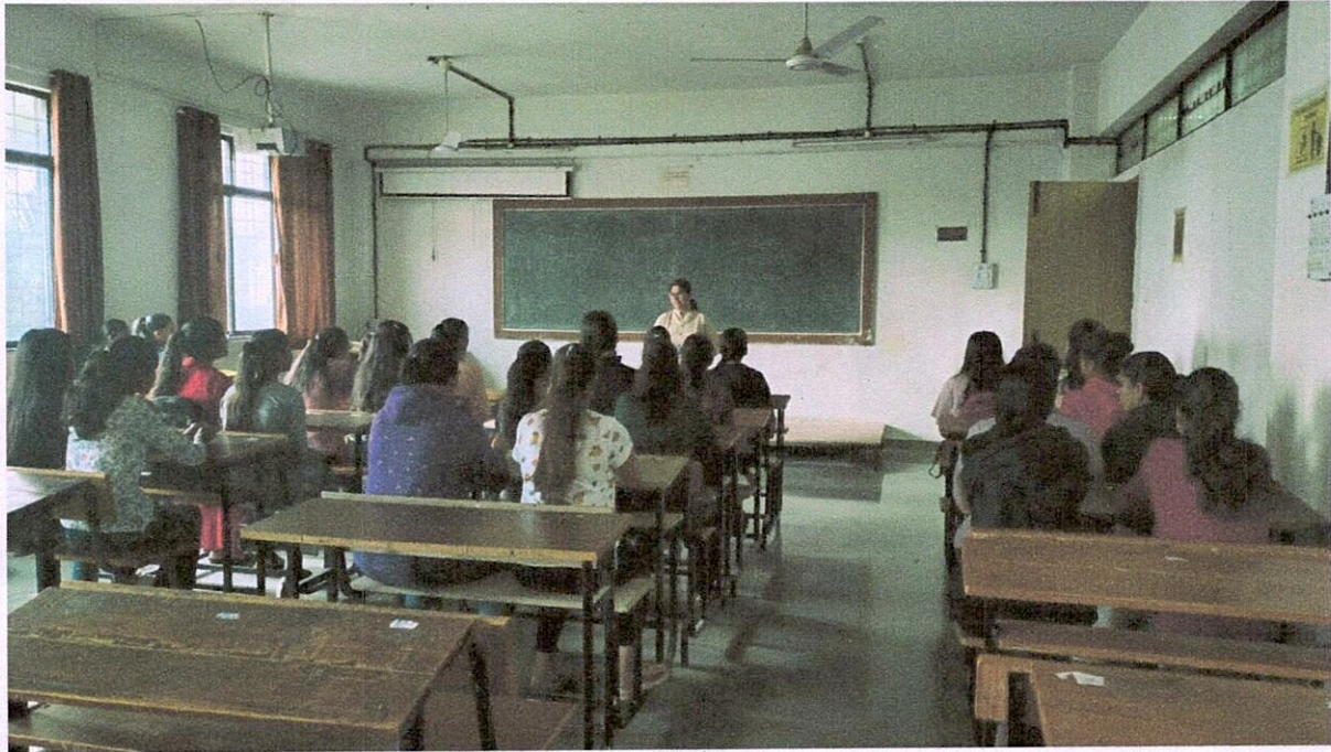
Guiding to the girl students