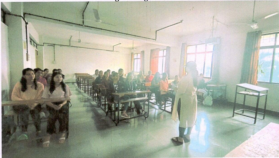
During the Guidance