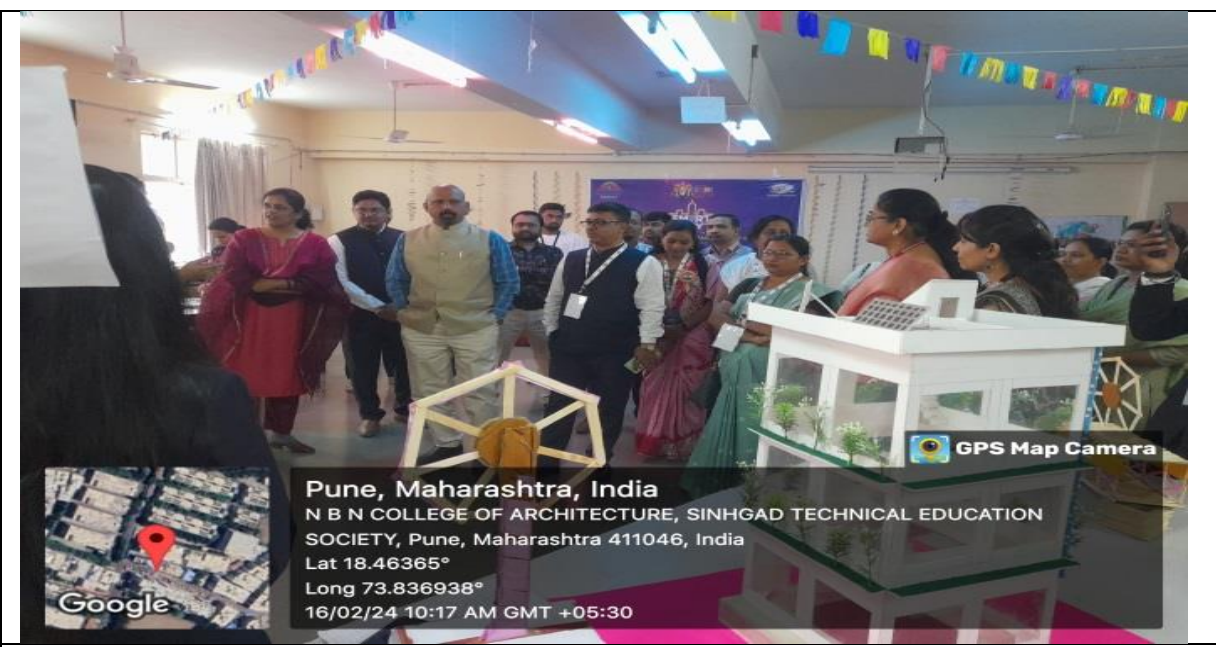
Students explained event and decoration to Dignitaries