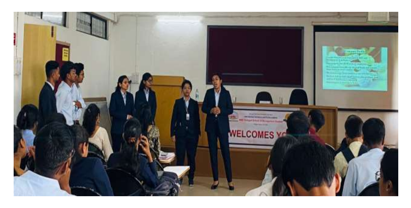
Students are presenting business plan with the help of PPT.