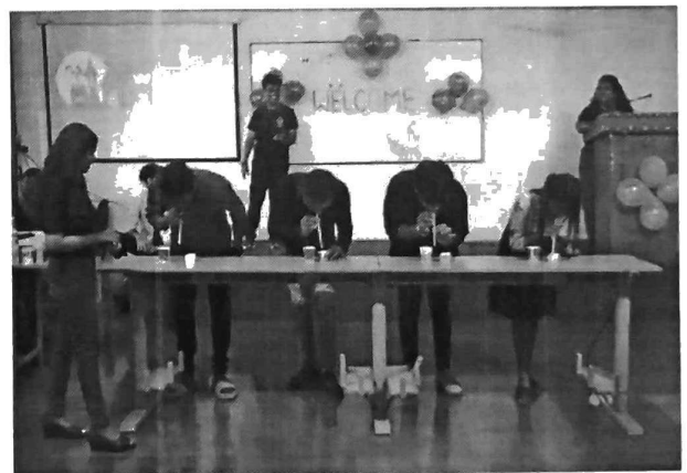
S.E students playing games