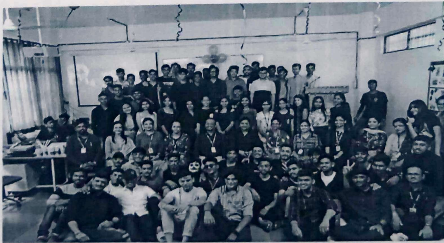
S.E students and faculties of IT Department