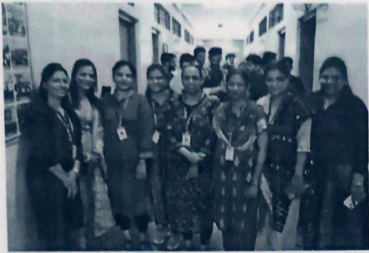
Faculties of IT Department