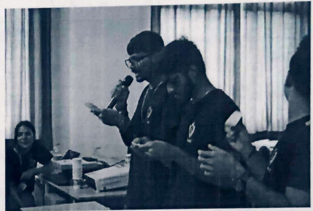
Glimpses of Event