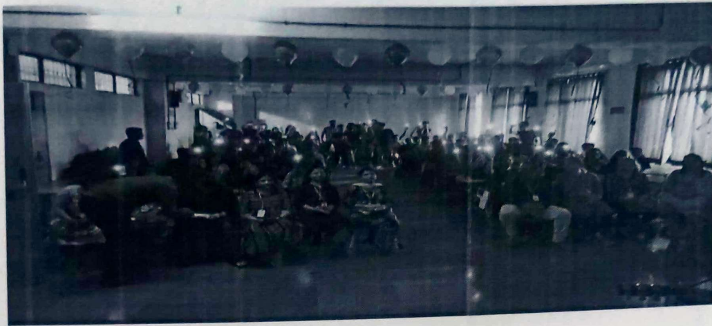
S.E Induction Program Glimpses