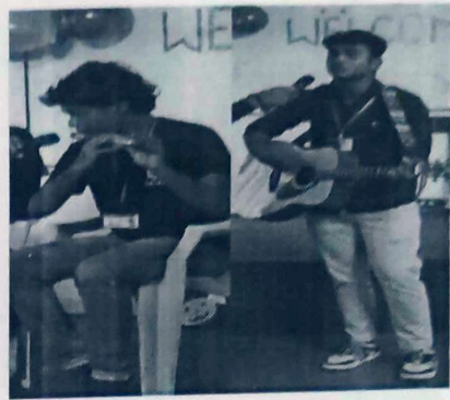
Cultural Program Gmिल्pses