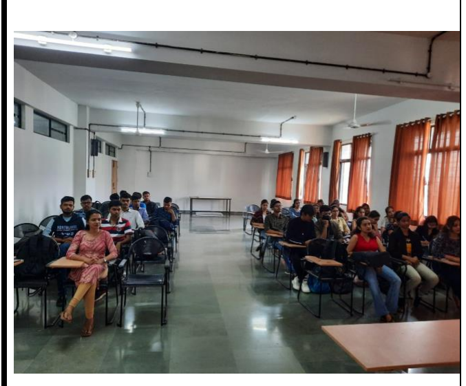
Students Attending Lecture in Offline Mode