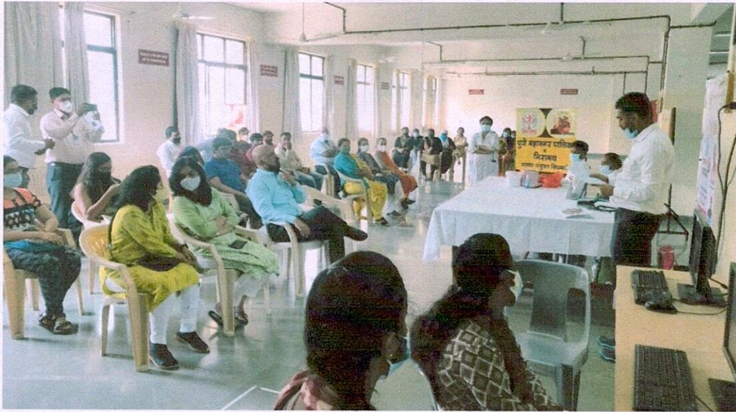
Staff, Non-Teaching staff and Students at the inauguration function of Vaccination Drive

Regd. Off.: STE Society, 19/15, Erandwane, Smt. Khilare Marg, Off. Karve Road, Pune - 411 004 Telefax: +91-20-25459751 Web: www.sinhgad.edu