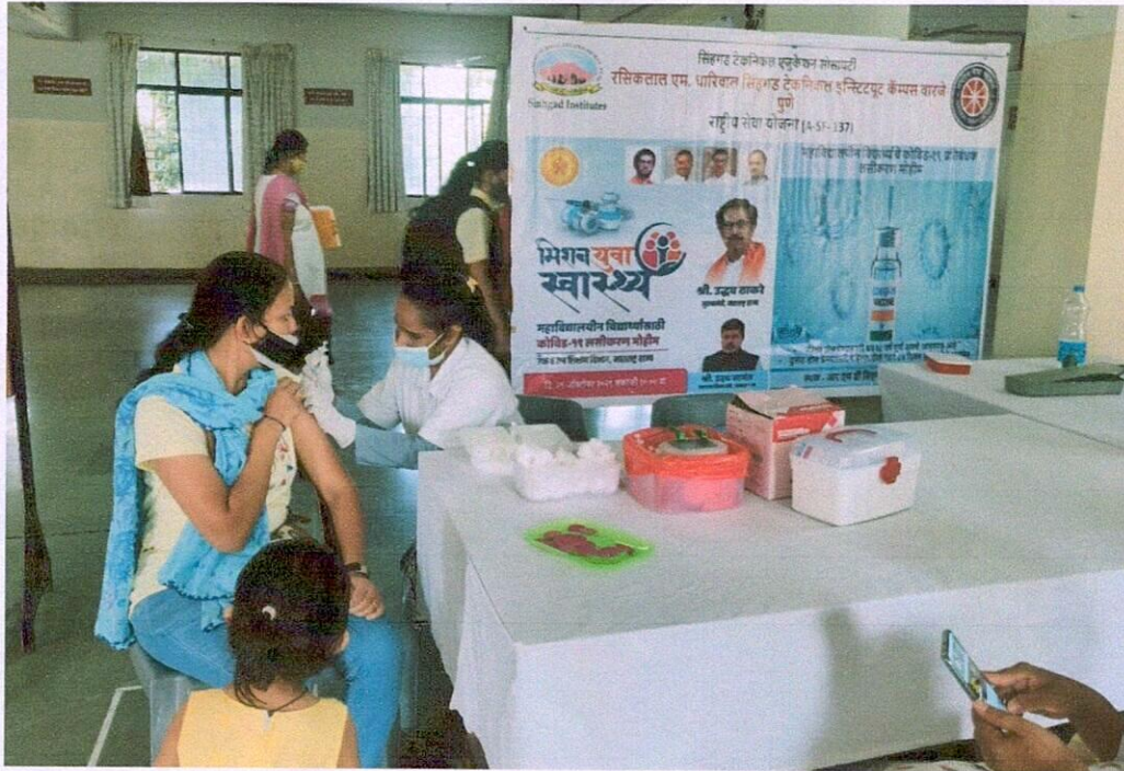
Teaching staff while getting vaccination

Regd. Off.: STE Society, 19/15, Erandwane, Smt. Khilam Marg, Off. Karve Road, Pune - 411 004 Telefax: +91-20-25459751 Web: www.sinhgad.edu