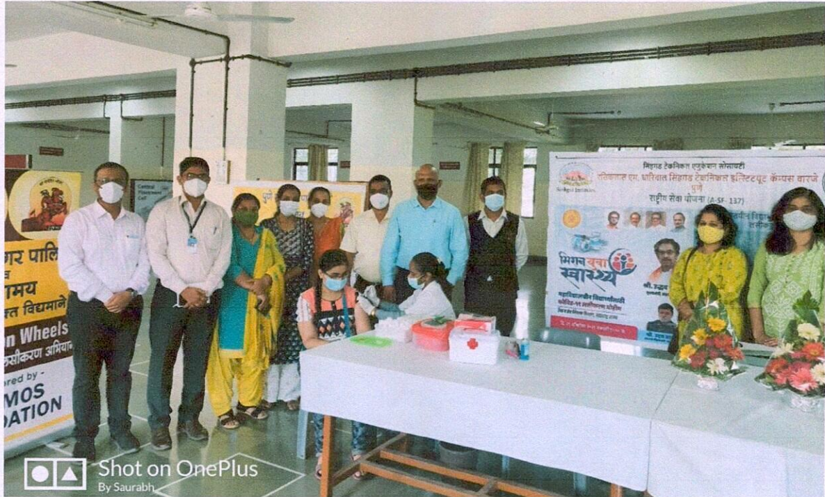
Director, Dean and All Head of Departments while vaccination of the student

Regd. Off.: STE Society, 19/15, Erandwane, Smt. Khilare Marg, Off. Karve Road, Pune - 411 004 Telefax: +91-20-25459751 Web: www.sinhgad.edu