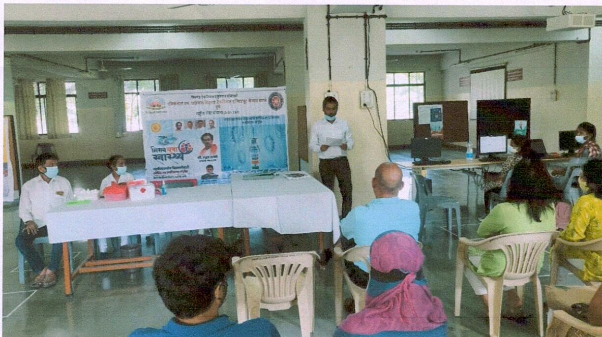
Director Sir and other staff during Inauguration of the vaccination drive