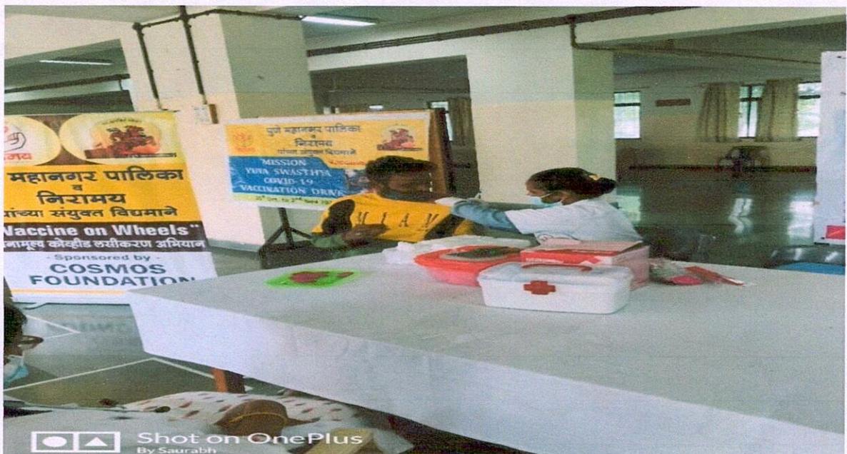
Non-Teaching staff while getting vaccination