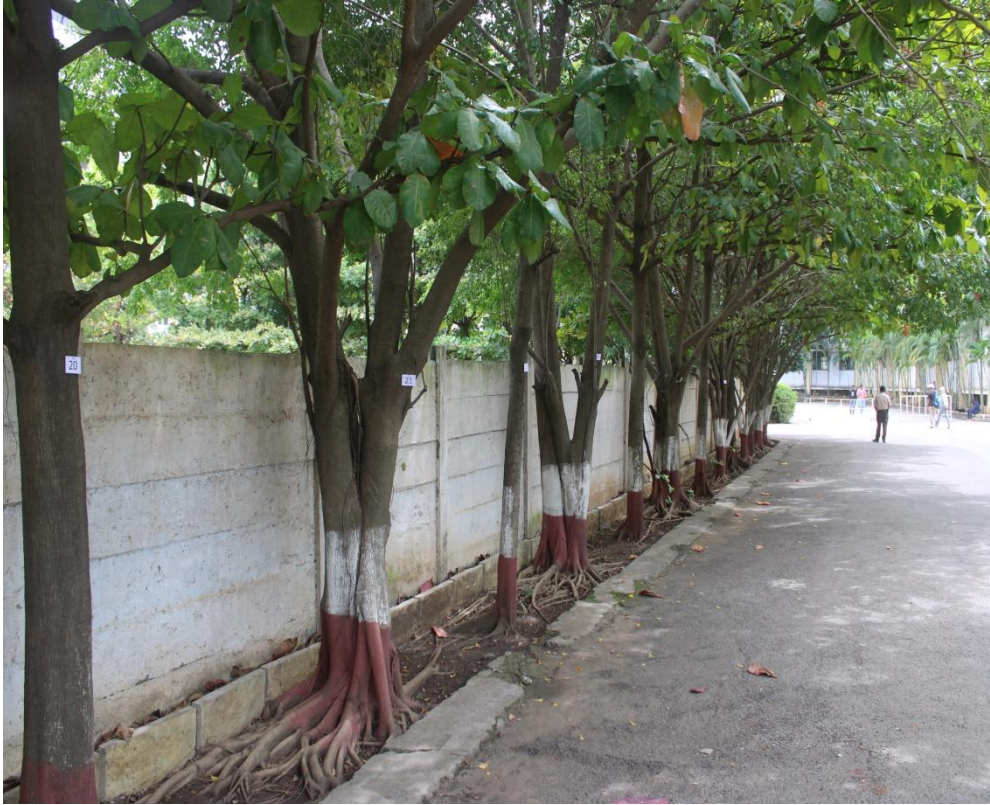
Figure 8- Maintenance of trees done by Club members