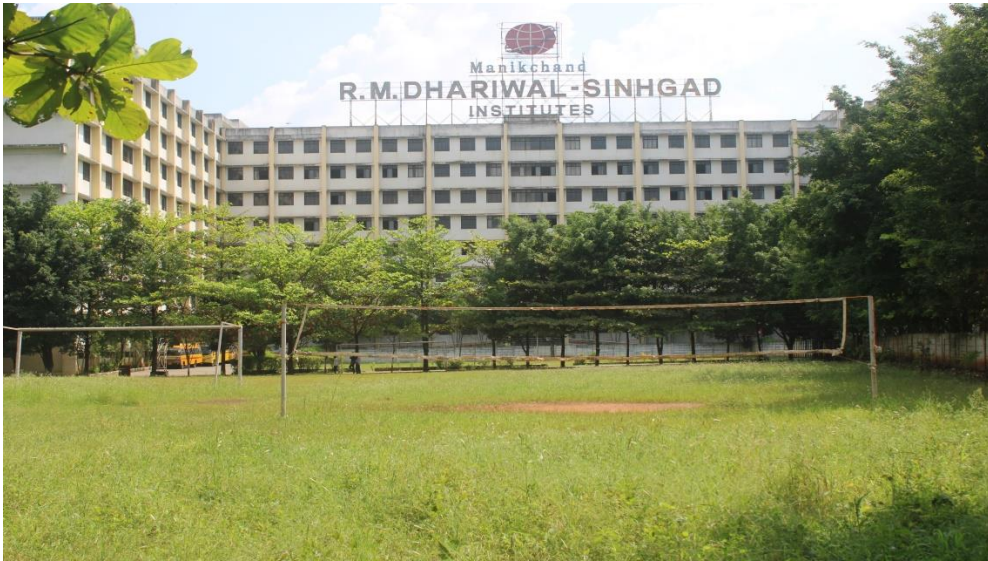
Figure 6- Campus surrounded by trees