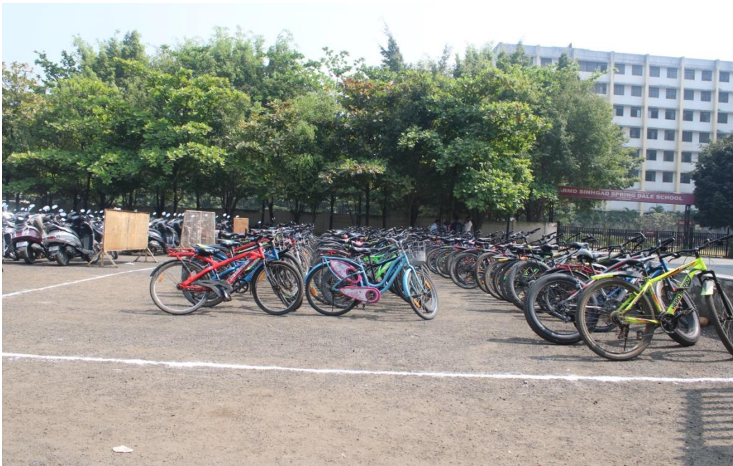
Figure 7- Encouraged students about maximum use of bicycles