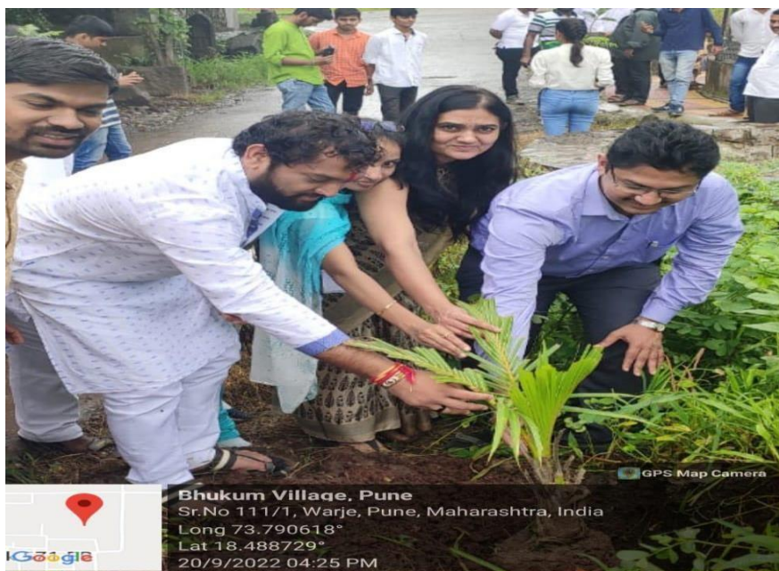
Figure5- Tree Plantation by the students and faculty members.