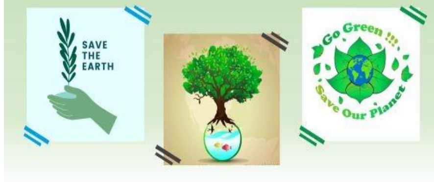
Environmental Club Flyer