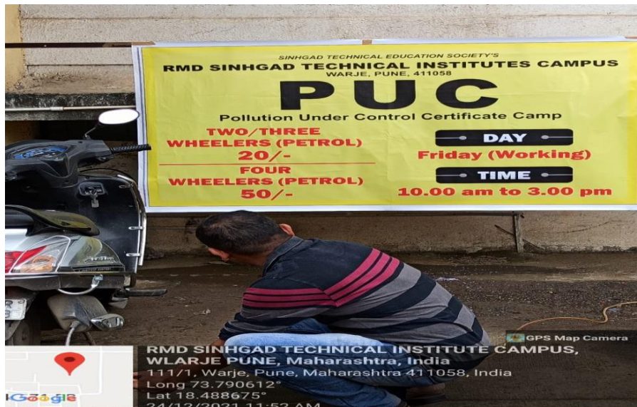
Figure 10- Pollution under Control Certificate Camp by RMDSTIC, Warje