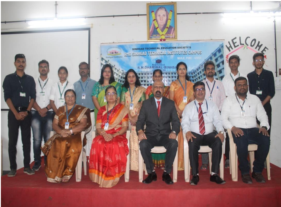
Figure 2- Environmental Club committee members with students