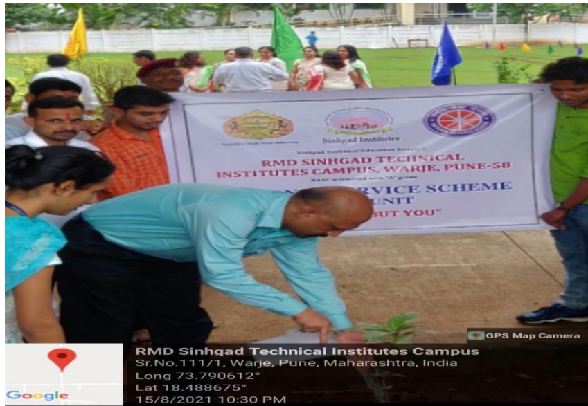
Figure 4- Tree Plantation by the Director.