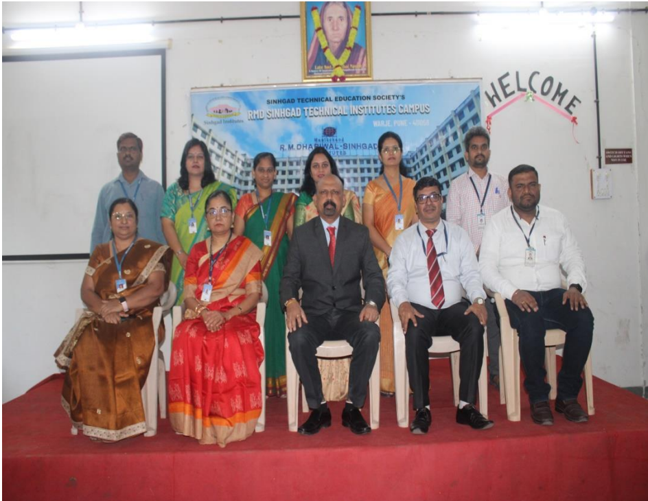
Figure 1- Environmental Club Committee members