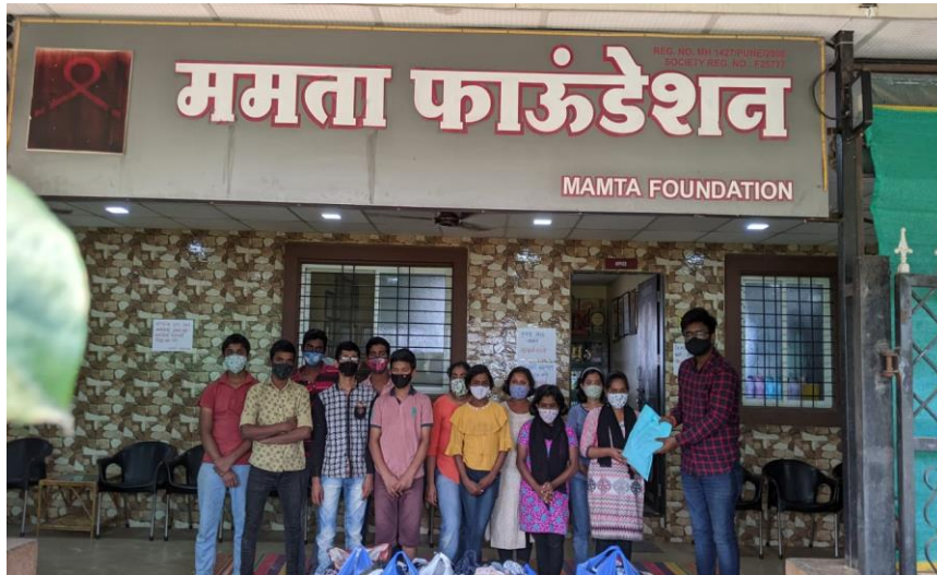
Figure 12- Cloth donation by club members