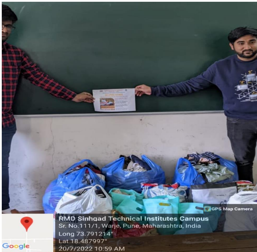
Figure 11- Cloth Collection at campus