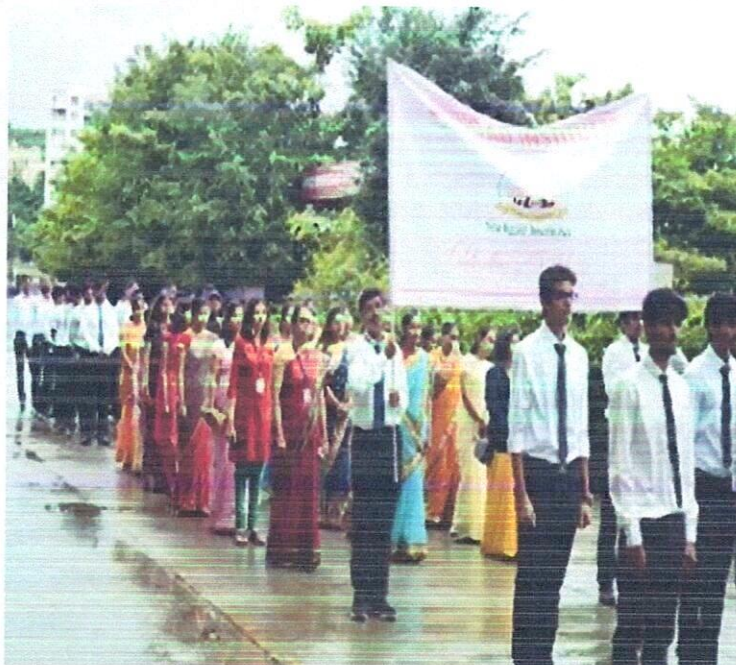
HODs of all Department and Teaching Staff participated in March Past