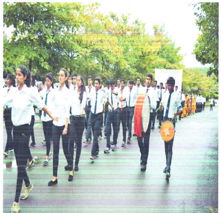
Students participated in March Past