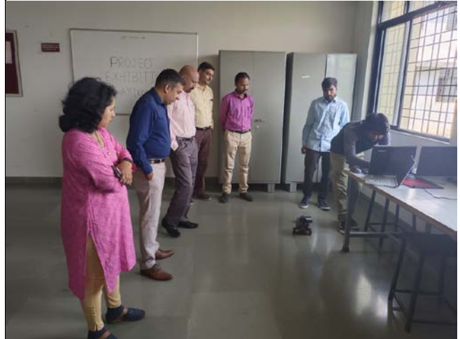
Students Project Demonstration