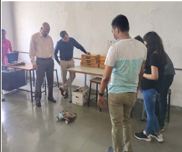
Students Project Demonstration