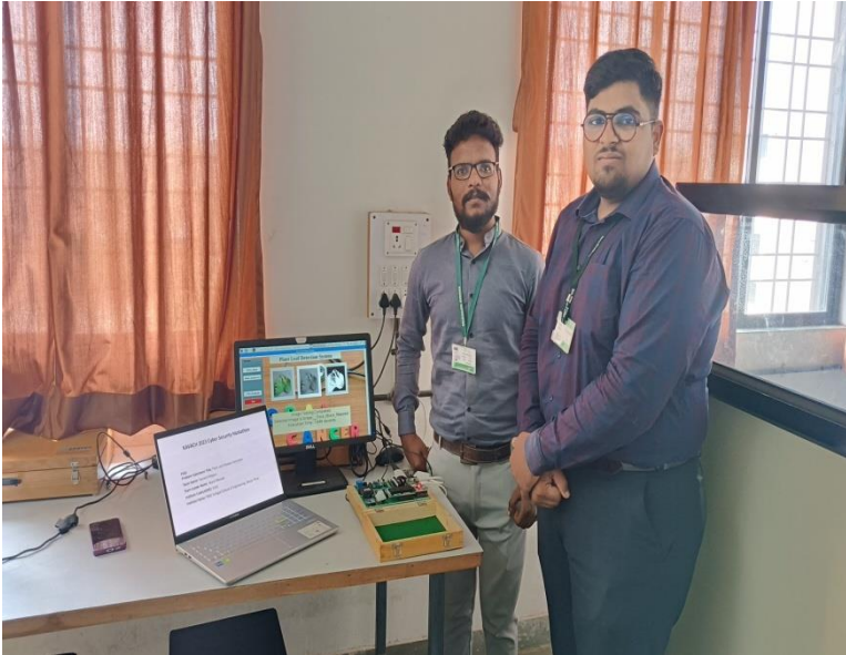
Working model of project.