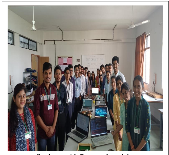
Students with Proposed models.