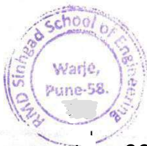
Director / Principal RMD Sinhgad Technical Institutes Campus Warje, Pune - 411 058.