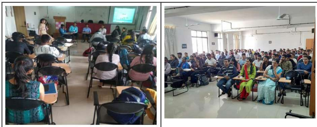
Finance Workshop on Securities Market -24/03/2022